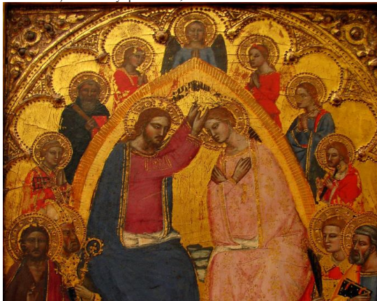
The Coronation of the Virgin Mary, Musee de Grenoble