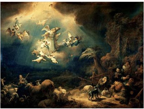
Angels anouncing Christ's birth to the Shepherds by Govert Flinck