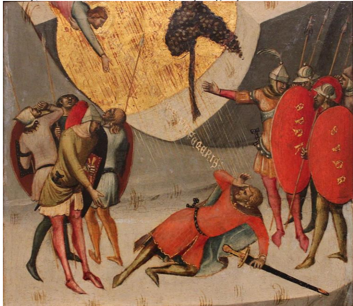
Conversion of Paul. 14th Century predella by Luca di Tomme, Seattle Art Museum

We confess our hatred and prejudices and all else that hinders us from godly union and concord. May we henceforth be all of one heart and soul, united in one bond of truth and peace, of faith and charity, and with one mouth we give you glory. Amen.