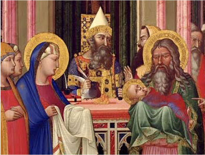
Presentation of Jesus at the temple, Ambrogio Lorenzetti, Uffizi

Lord God, the springing source of everlasting light, pour into the hearts of your faithful people the brilliance of your eternal splendour, that we, who by these kindling flames light up the temple to your glory, may have the darkness of our souls dispelled, and so be counted worthy to stand before you in that eternal city where you live and reign. Amen