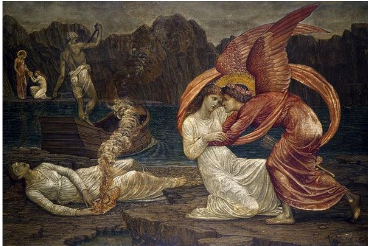
Cupid and Psyche by Edward Burne Jones, Palace Green murals

Beloved let us love one another, for love is of God. Everyone who loves is born of God and knows God. Whoever does not love does not know God, for God is love. Amen