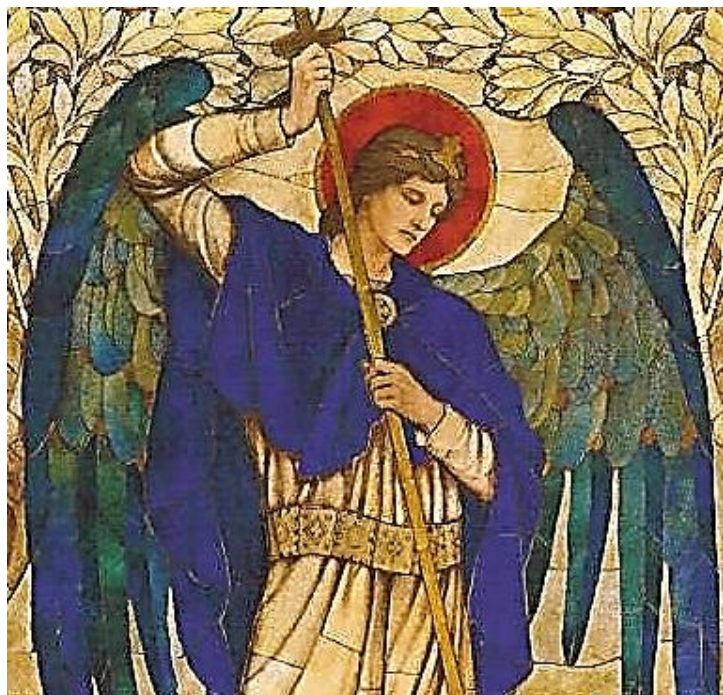
St Michael the Archangel, by James Powell & Sons. St Johns Church, Boreham, Wiltshire

Everlasting God, you have ordained and constituted the ministries of angels and mortals in a wonderful order: grant that as your holy angels always serve you in heaven, so, at your command, they may help and defend us on earth; Amen