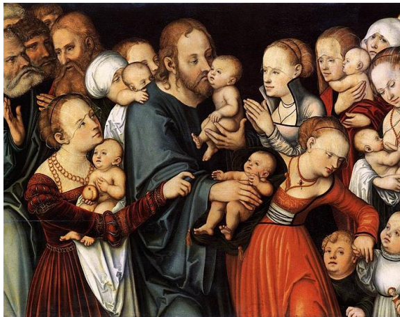
Christ Blessing the children, by Lucas Cranach the Elder, Stadel Museum, Frankfurt

Loving Father and Creator of all, we come to you today deeply grateful for your creation. As we look around us we are amazed at the greatness and majesty of all that you have made. May we show our love and reverence to you, our Lord, by caring for all that you have created. We humbly give you praise and thanks. Amen