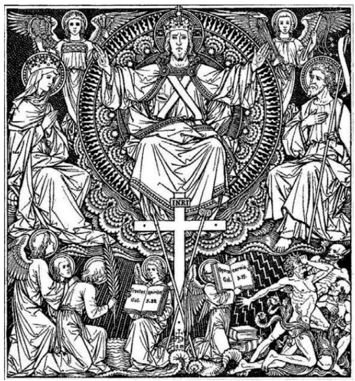
Christ as King, pintrest

Almighty and merciful God, look with mercy on those who today are fleeing from danger, homeless and hungry. Bless those who work to bring them relief; inspire generosity and compassion in all our hearts; and guide the nations of the world towards that day when all will rejoice in your Kingdom of justice and of peace. Amen