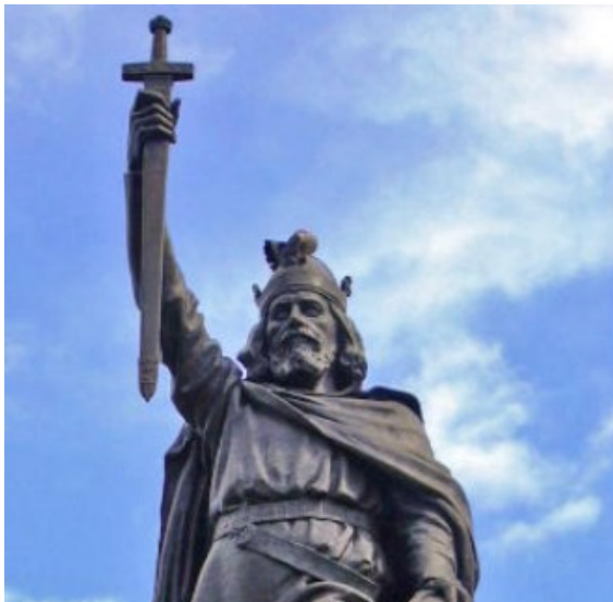
Alfred the Great sculpture at Winchester by Hamo Thornycroft