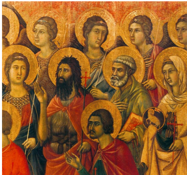
Detail of Maesta at Museo del Opera del Dumo, Siena. Pintrest

May light eternal shine upon them, O lord, with thy saints for evermore for thou art gracious. Eternal rest give to them, O lord and let perpetual light shine upon them. With Thy saints for evermore. Amend