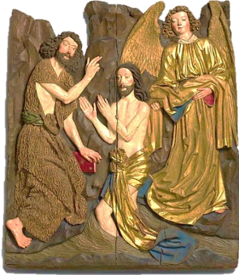
Baptism of Christ, Veit Stoss, Met Museum of Art.

Lord, give us the grace to know you deeply, in order to love you entirely. May the gift of your Holy Spirit enable our eyes, ears and minds to receive the unconditional love with which you love us. Purify our hearts that we may always be ready to love our neighbour, however different, as ourselves. Through the self-giving life of Christ our Lord. Amen