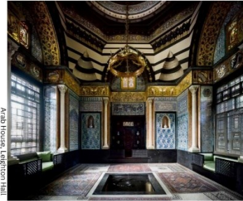
Arab House, Legation Hill