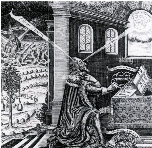
Eikon Basilike, King Charles I, the portait of his sacred Majesty in his solitude and suffering. 1649 woodcut. Published after his funeral

O Lord, the Governor of all things, set bounds to our passions, to our errors by truth, to our discontents by good laws justly executed, and to our divisions by charity, that we may be a country at unity in itself. Grant this, O God, in thy good time and for ever, for Christ's sake. Amen.