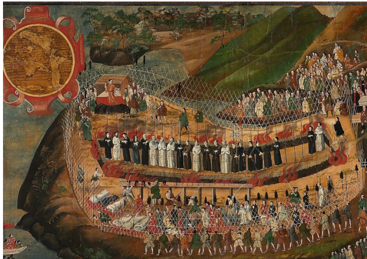
The Christian Martyrs of Nagasaki, Japanese Painting c 16 th / 17 th Century.