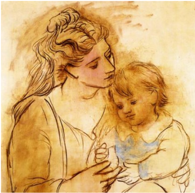
Mother and Child by Pablo Picasso.