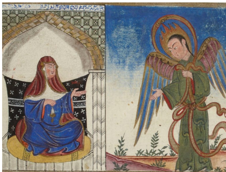
Islamic Annunciation – The remaining signs of Past Centuries.

We beseech you, O Lord, pour your grace into our hearts, that as we have known the incarnation of your Son Jesus Christ by the message of an angel, so by his cross and passion we may be brought to the glory of his resurrection; through Jesus Christ your Son our Lord, who is alive and reigns with you, in the unity of the Holy Spirit, one God, now and for ever. Amen