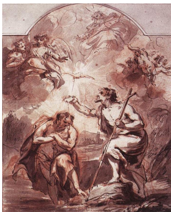
Please remember before God those who have asked for our prayers

We pray for Australia and its people in this time of drought, for those on farms and in rural areas deprived of harvests and livestock, livelihood and hope. May God send rain to water the earth and help for those in need.