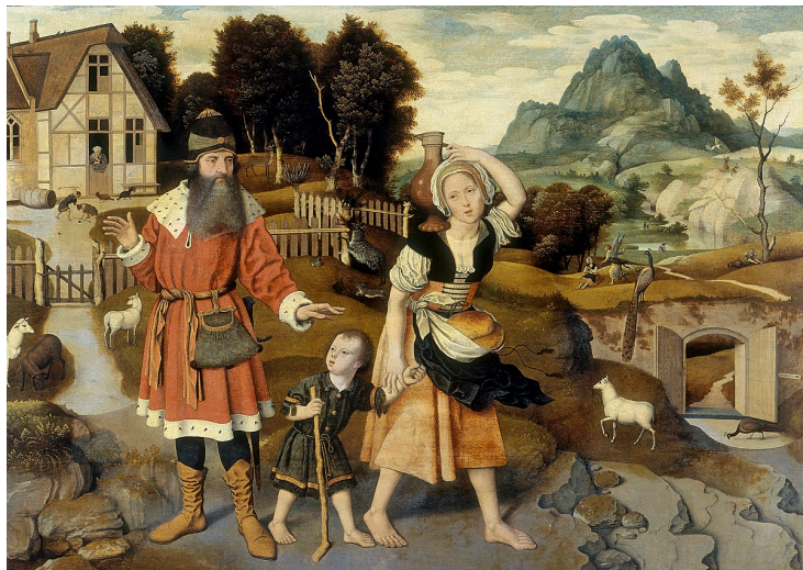
Abraham despide a Agar e Ismael by Jan Mostaert

Faithful Creator, whose mercy never fails: deepen our faithfulness to you and to your living Word, Jesus Christ our Lord. Amen