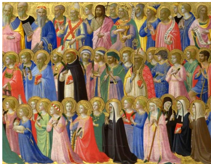
The Glorification of Christ by Fra Angelico.

We give thanks for all preachers and teachers, and pray that, through the word proclaimed and shared, your church may grow in holiness and discipleship. Amen.