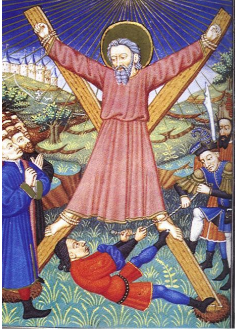
The Martyrdom of St Andrew

Almighty God, who gave such grace to your apostle Saint Andrew that he readily obeyed the call of your Son Jesus Christ and brought his brother with him: call us by your holy word, and give us grace to follow you without delay and to tell the good news of your kingdom; through Jesus Christ your Son our Lord, who is alive and reigns with you, in the unity of the Holy Spirit, one God, now and for ever. Amen