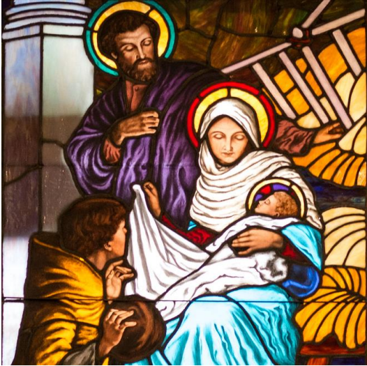
Nativity, St Mary, Star of the sea, Duluth.

Eternal God, in the stillness of this night you sent your almighty Word to pierce the world's darkness with the light of salvation: give to the earth the peace that we long for and fill our hearts with the joy of heaven through our Saviour, Jesus Christ. Amen