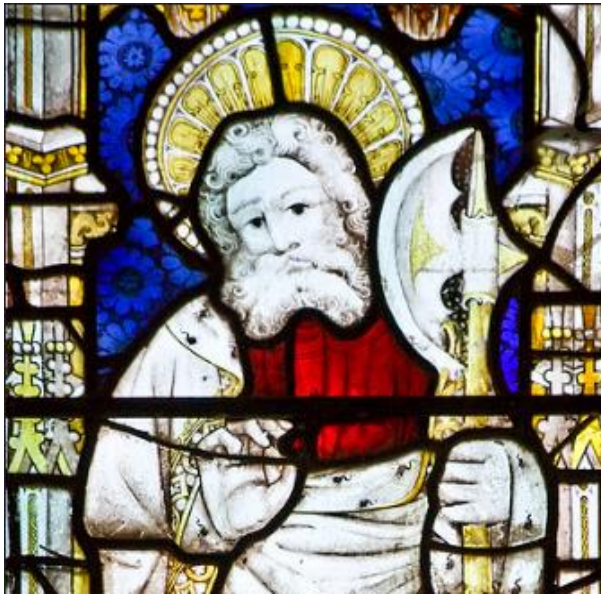
St Matthias, All Souls Chapel, Oxford.

Lord, you reach into the darkness with hope, truth and light. Stretch out your strong hand in this situation, hold and rescue those who have suffered. Let your almighty love move mountains, cross seas and breathe life into the darkest places. Amen The Spiritual Life