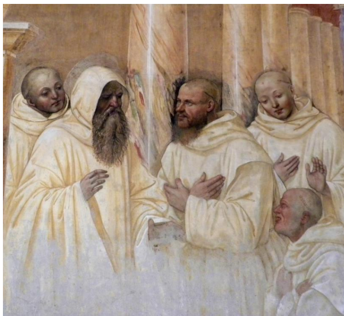
Life of St Benedict by Sodoma Signorelli, Monte Oliveto Maggiore & Sant Antimo

Gracious and Holy Father, give us wisdom to perceive you, intelligence to understand you, diligence to see you. patience to wait for you, eyes to behold you, a heart to meditate on you and a life to proclaim you. Amen