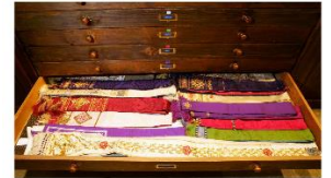
VESTMENTS - THE STOLE

The chalice is a cup used for drinking. It is made of silver or gold and is used to hold the wine used in the Eucharist. The chalice is held by the deacon or the priest during the service. The chalice is a symbol of the blood of Christ and is used to remind us of the sacrifice of Jesus.