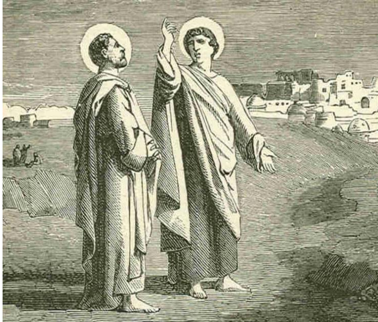
Sts Simon and Jude.

Compassionate God, who sent Jesus Christ to deliver us from all manner of injustices and inequalities, create in us new hearts and enlarged visions, to see the image of God in every person irrespective of background, race and ethnicity. May we be generous in our love of others as we work towards ending misunderstanding, racism and injustice; creating communities of human flourishing. Amen