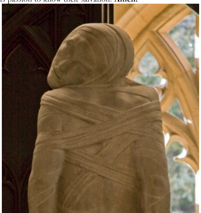
Lazarus by Sir Jacob Epstein, New College, Oxford.