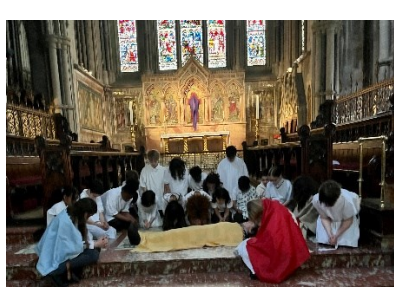
Passion Sunday Play