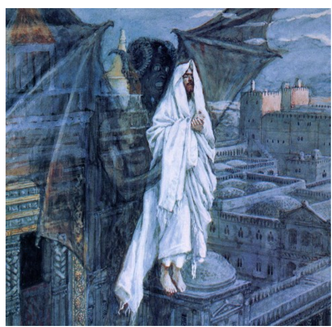
Jesus tempted by beauty, James Tissot

Loving God, you have created the world and everyone in it. Help us to watch out for signs of your goodness in our world, in other people and in ourselves. Amen. CoE Watch and Pray booklet