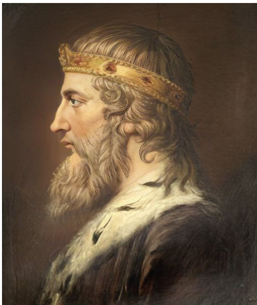
King Alfred, by Samuel Woodforde, Wikipedia

Most holy God and Father, hear our prayers for all who strive for peace and all who fight for justice. Help us, who today remember the cost of war, to work for a better tomorrow; and, as we commend to you lives lost in terror and conflict, bring us all, in the end, to the peace of your presence; through Christ our Lord. Amen