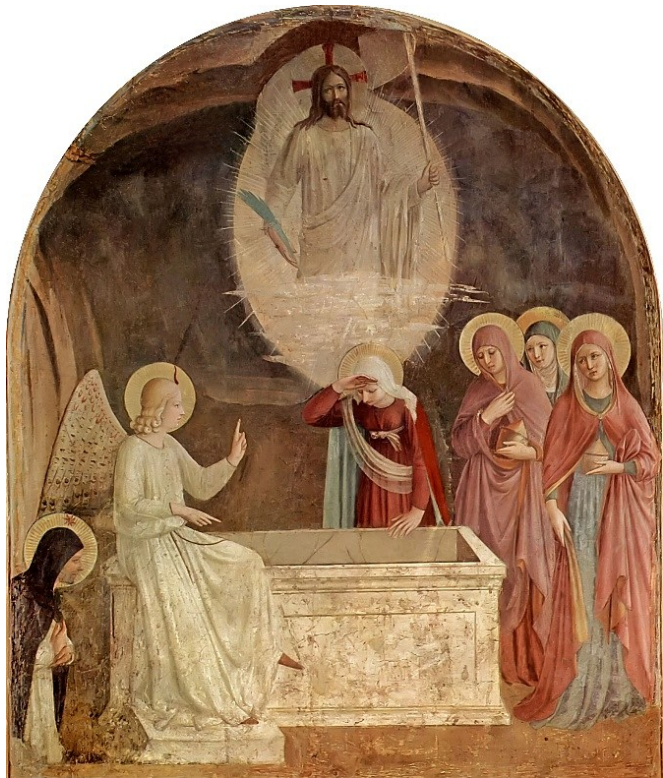
Resurrection of Christ and women at the tomb, Fra Angelico, Florence

God of glory, by the raising of your Son you have broken the chains of death and hell: fill your Church with faith and hope; for a new day has dawned and the way to life stands open in our Saviour Jesus Christ. Amen