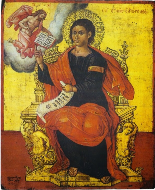
Thomas the Apostle, Orthodox Icon

I planted, Apollos watered, but God gave the growth. So neither the one who plants nor the one who waters is anything, but only God who gives the growth. The one who plants and the one who waters have a common purpose, and each will receive wages according to the labour of each. For we are God's servants, working together; you are God's field, God's building. Amen