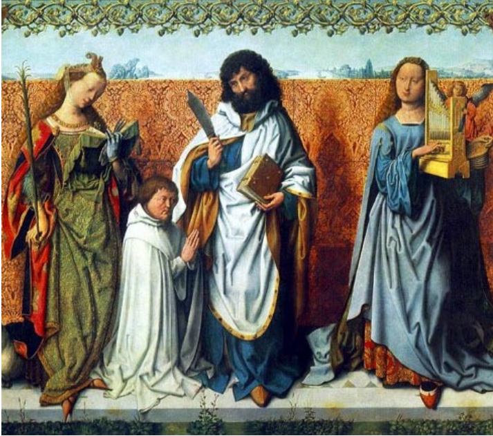
The story of Bartholomew the Apostle

In the warmth of the summer, as we gather with friends and family, we offer our gratitude for these precious moments. May our gatherings be filled with laughter, love and shared memories that last a lifetime. Bless our time together and help us cherish each moment.