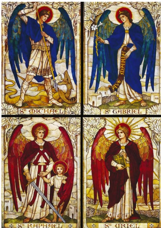
The four archangels 1888 mosaics by James Powell and Sons, St John's Church, Wiltshire

Father in heaven, you give your angels charge over those who trust in you to guard them in all their ways. Be with those in trouble, rescue them and show them your salvation. Amen