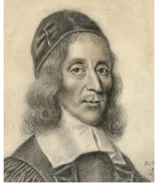
George Herbert, priest, poet and Hymn writer, including 'Let all the world in every corner sing'. Image from St Andrews church Bemerton (27 th February)