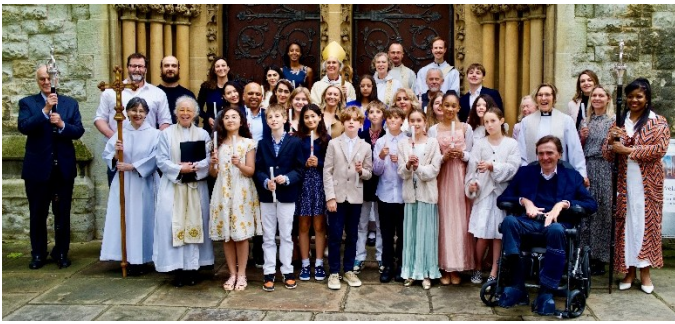
Last year's Confirmation Group after the service