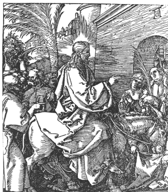
Jesus Enters Jerusalem